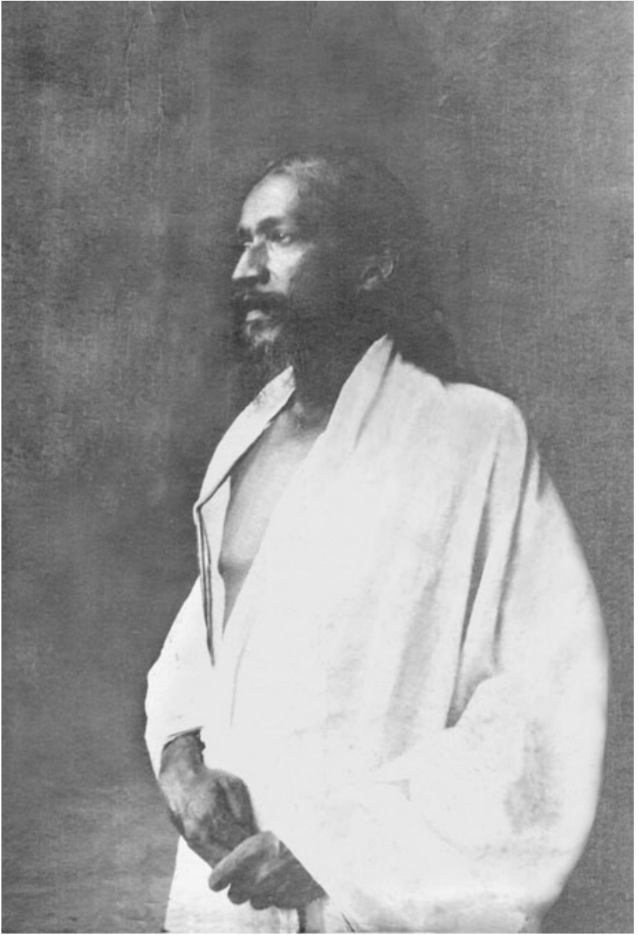
Sri Aurobindo in Pondicherry, c. 1915