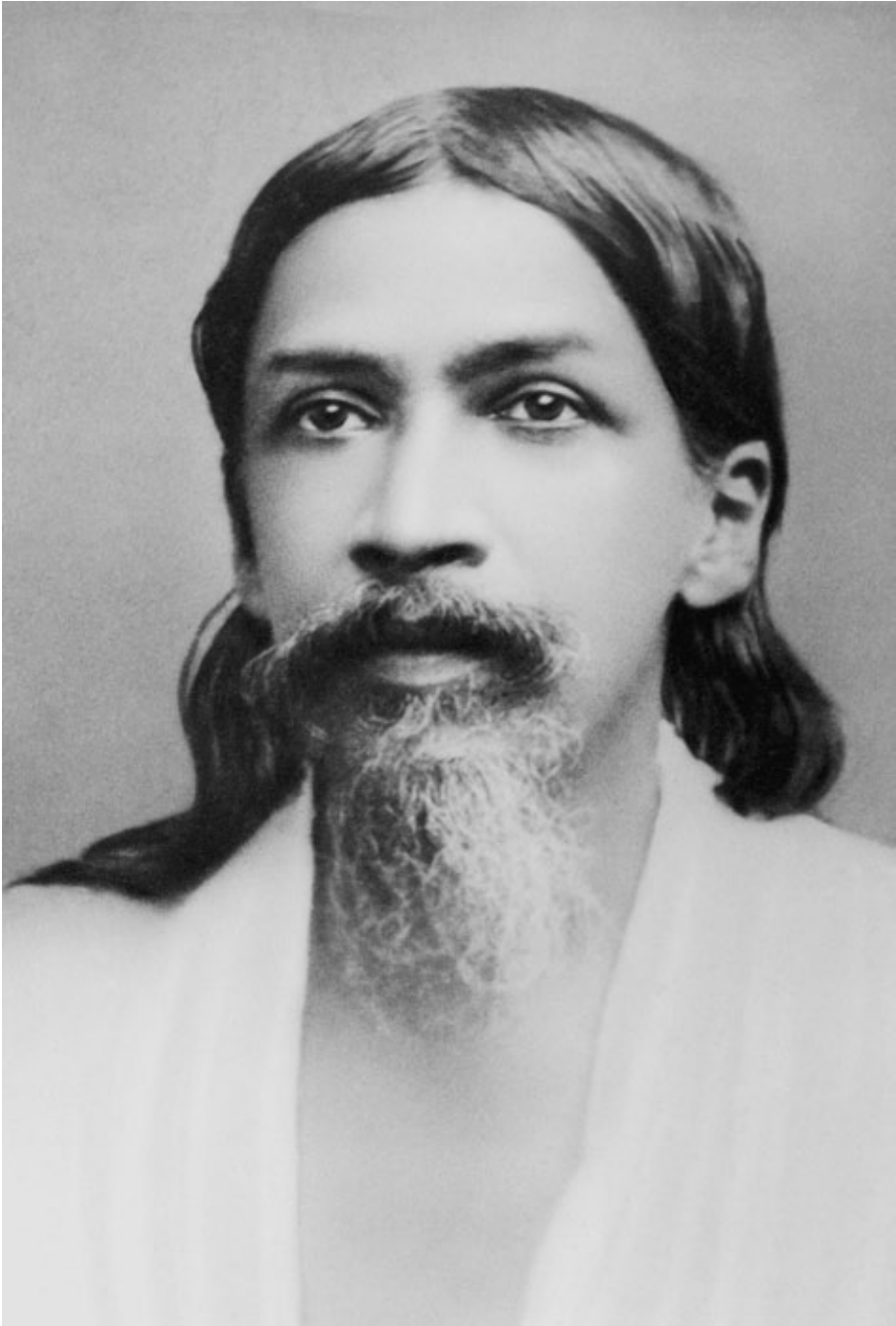
Sri Aurobindo in Pondicherry