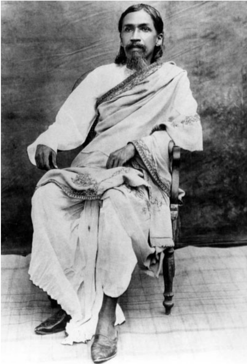
Sri Aurobindo, Pondicherry, 1915-1918