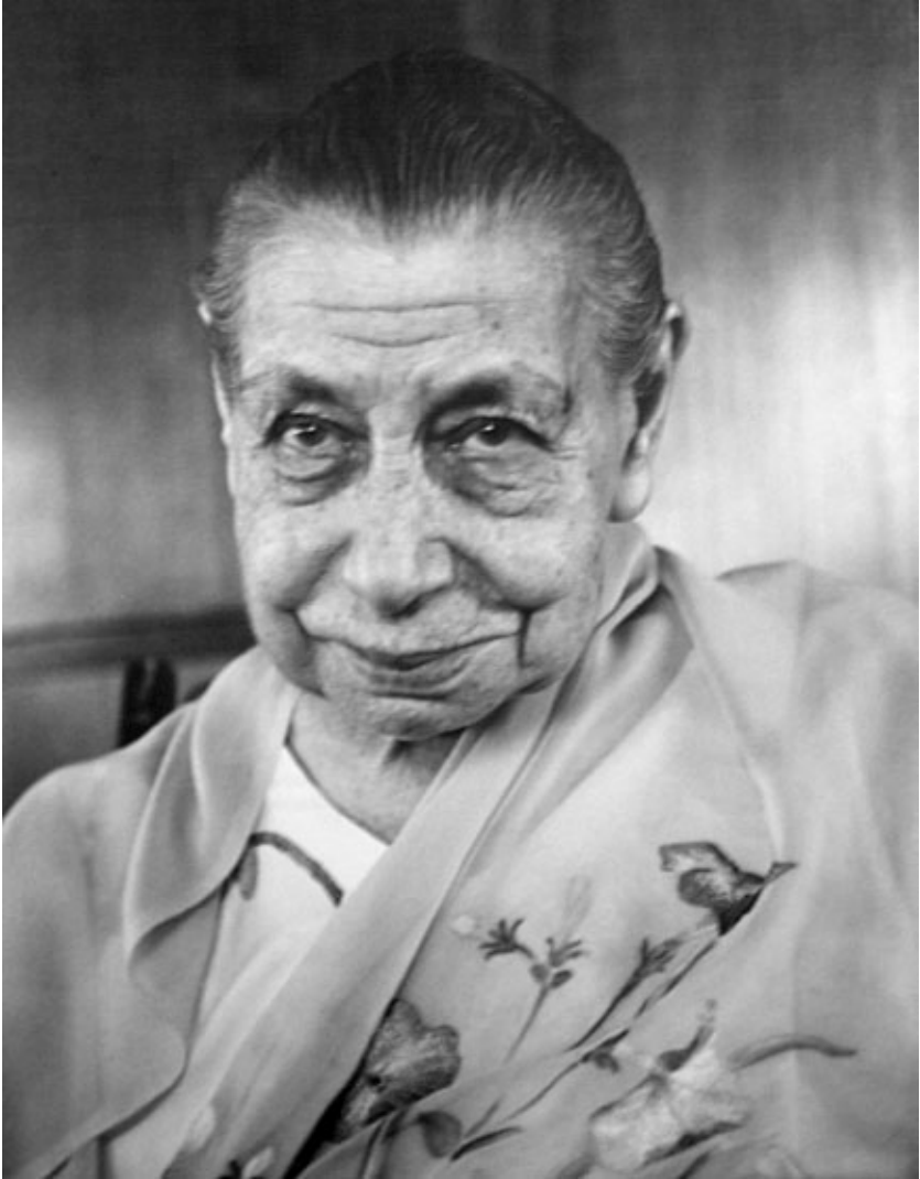
The Mother - 1969