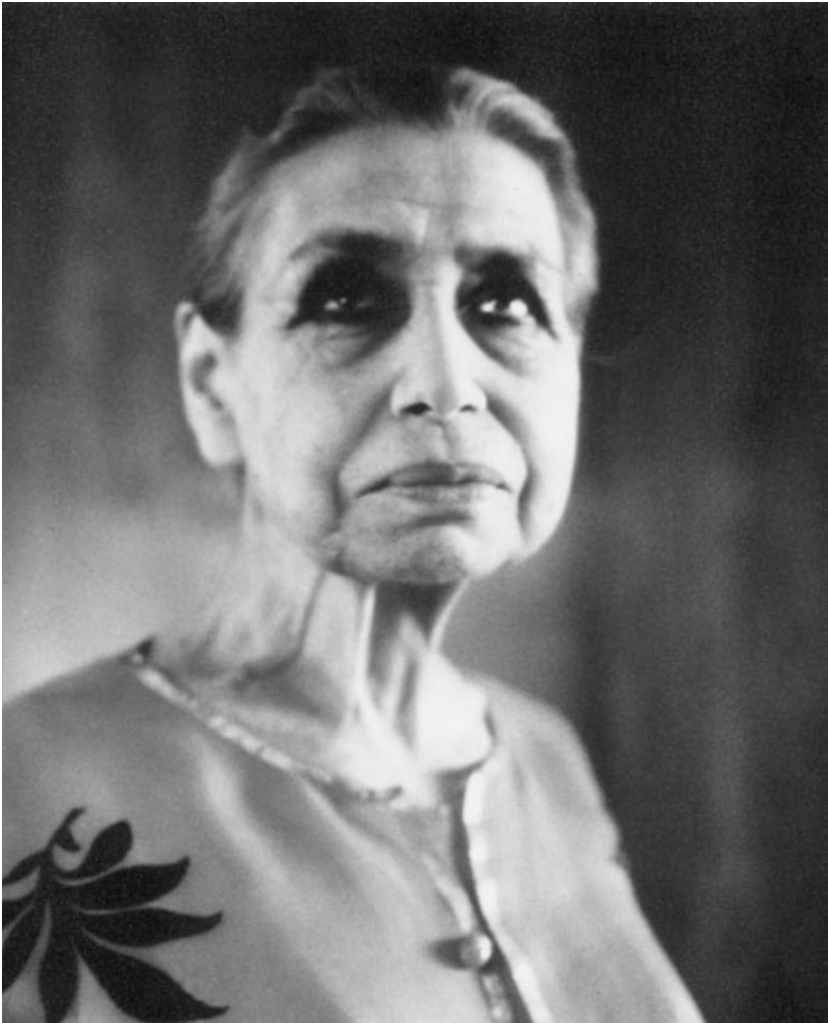
The Mother - 1960