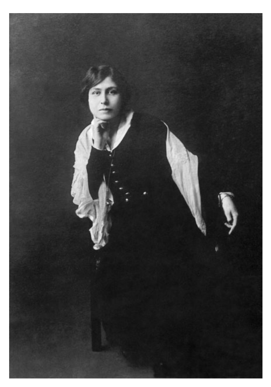
The Mother in Tokyo, 1917