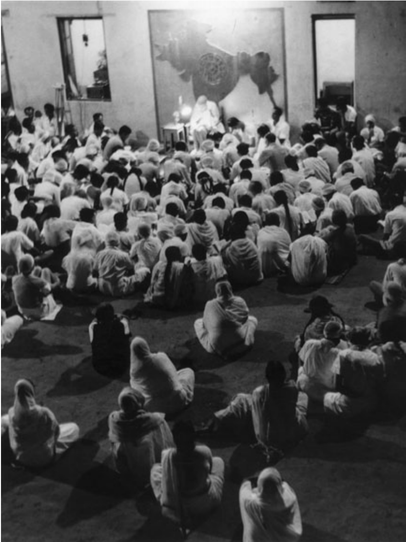
The Mother taking a class at the Playground, 1954