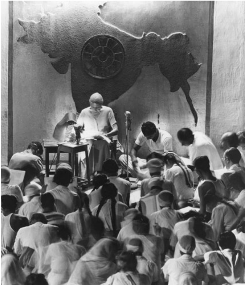
The Mother taking a class at the Playground, 1954