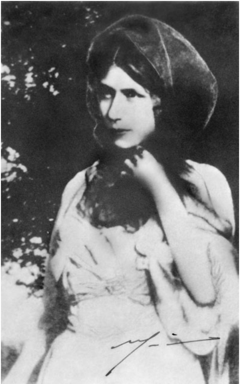
The Mother in Algeria, 1906-1907