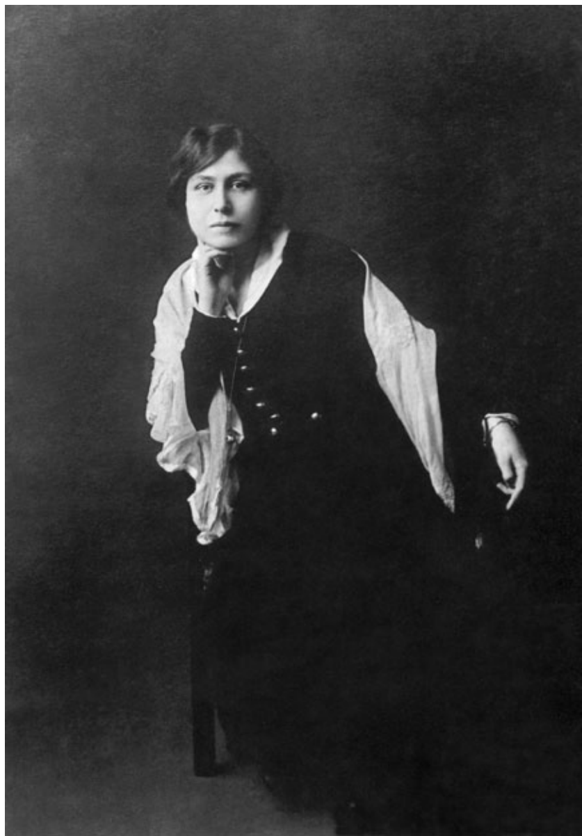
The Mother in Tokyo, 1917