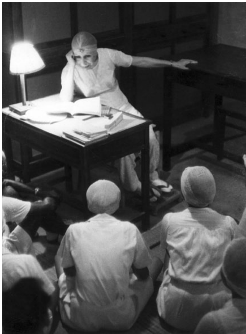
The Mother taking a class, April 1950